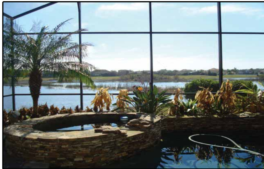
Screened Pool & Spa with Stone work