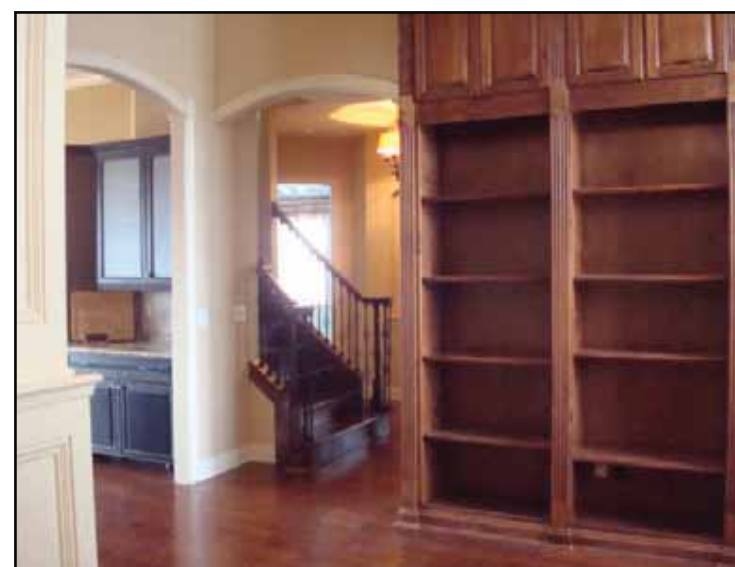
Hardwood Floors & Millwork