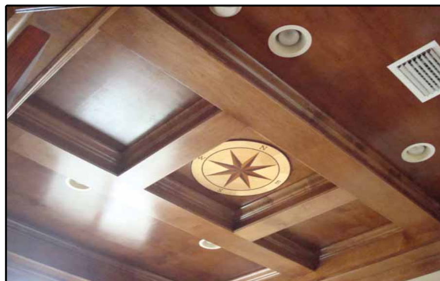
Extensive Ceiling Work

Property Facts Bedrooms/Baths - 5/4.5 Heated Square Feet - 4068 Year Built - 2005 Taxes for 2009 - $11,650 Monthly HOA - $189.00