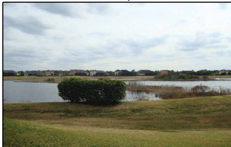
View Of Lake Irish