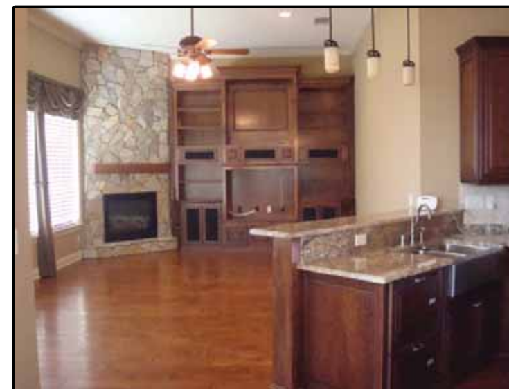
Family Room with Fireplace